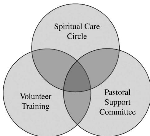
FIGURE 1 Training and sustaining model for spiritual care in long-term care.